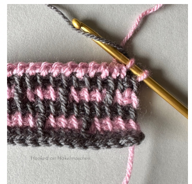
Hooked on Häkelmaschen

For this pattern, you need to change the colour after each row. It is changed at the end of the return pass, when there are only two loops left on the hook. Simply pick up the new colour and pull it through the last two stitches at once. The last stitch on the crochet hook now has the new colour. The unused yarn is not cut but carried along the side.