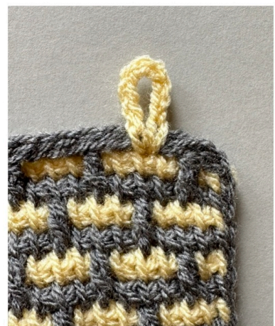
Hooked on Häkelmaschen