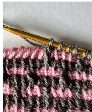
Hooked on Häkelmaschen